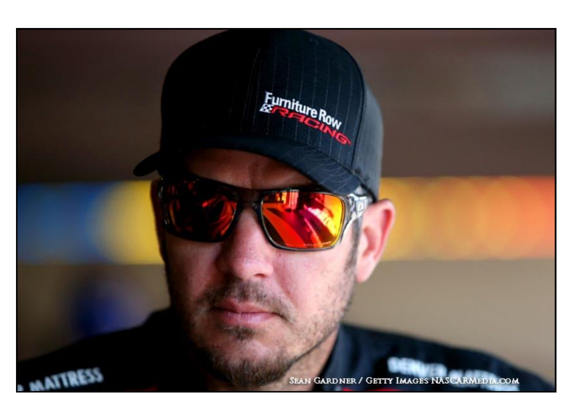
Dan Beaver's Fantasy Racing News