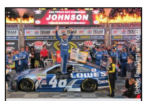
Original columns, commentary, photos, race coverage and fantasy NASCAR analysis by our staff of female writers and photographers.

car wins in Pennsylvania Speedweeks and that is going